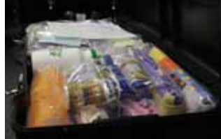
The congregation has been donating items to take to Honduras throughout the year.

What they plan to do: The team will provide medical, dental and optometry services to an anticipated 1,500 residents of the Tegucigalpa area. Their services will include prescribing and giving medicine; diagnosing ailments; providing eye exams and prescription glasses; cleaning and extracting teeth (if needed); washing children's hair; and sharing the love of Jesus.